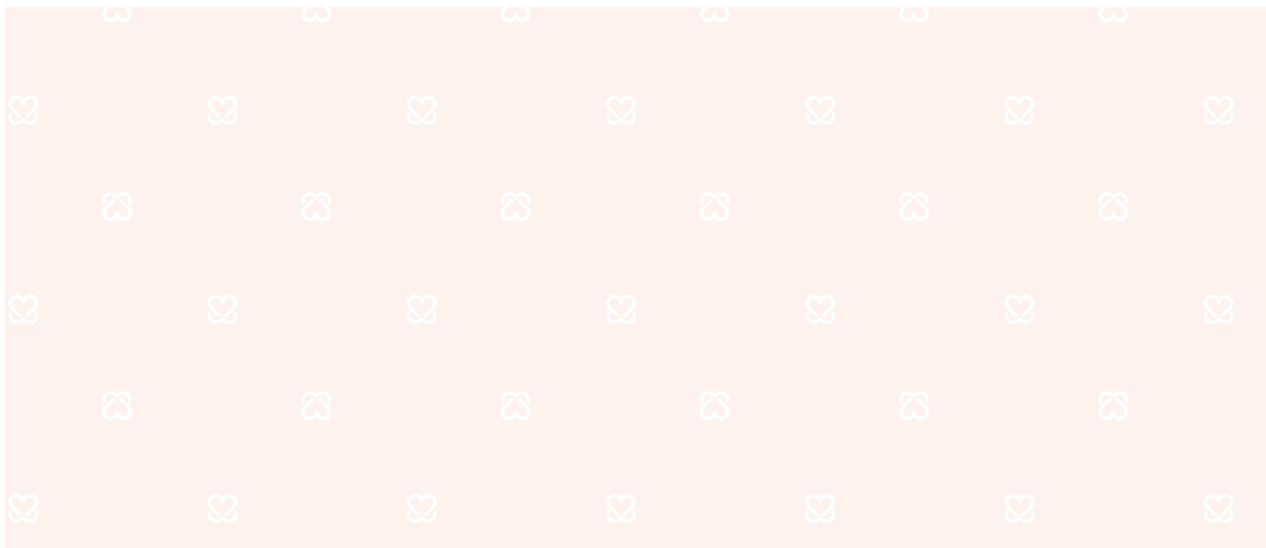
100% WHITE KAB HEARTS ON PEARL