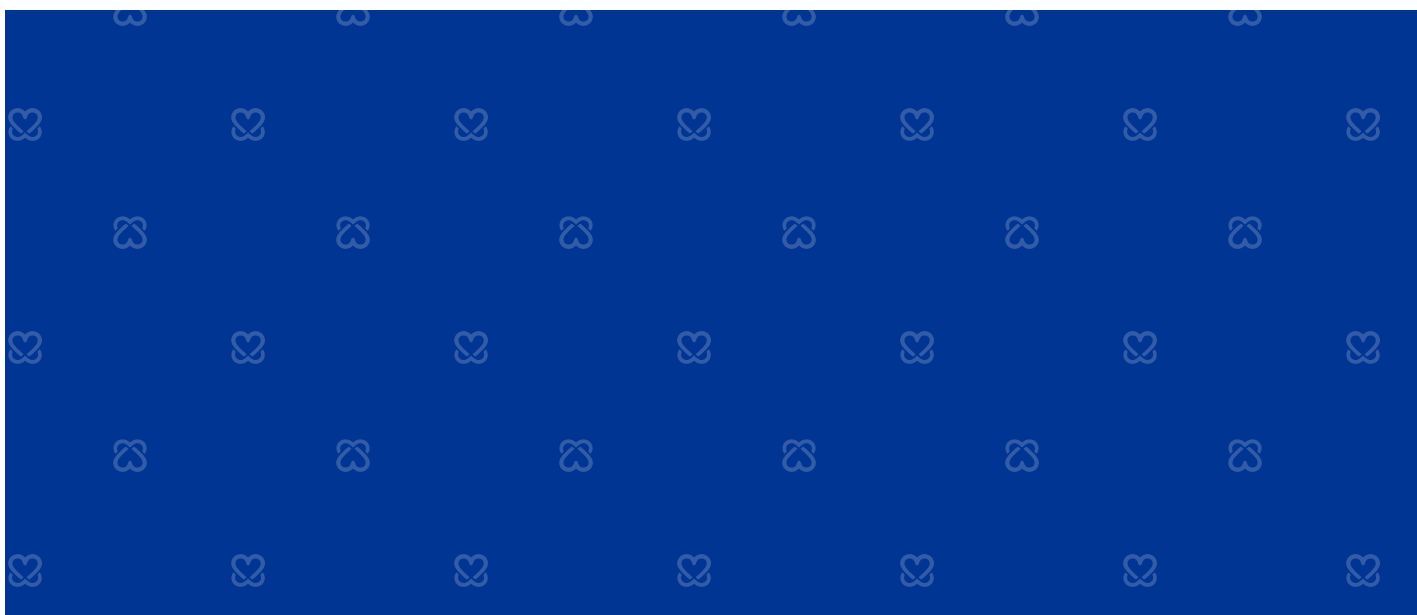
20% WHITE KAB HEARTS ON INDIGO